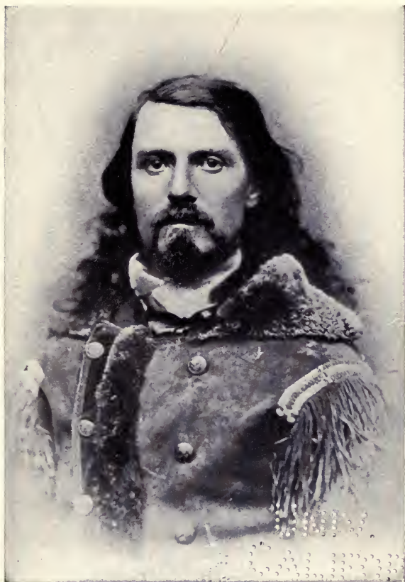
WILLIAM FREDERICK CODY "BUFFALO BILL"